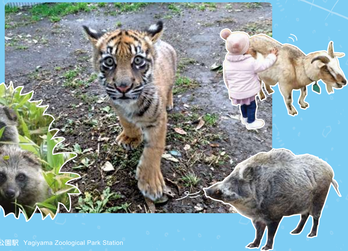
01 八木山動物公園駅 Yagiya Zoological Park Station

The Sendai Subway Tozai Line stretches across the city from east to west, connecting visitors to areas further removed from Sendai's urban center. For travelers looking for something a bit different from the typical tourist attractions, the Tozai Line is a gateway to three unique museum experiences.