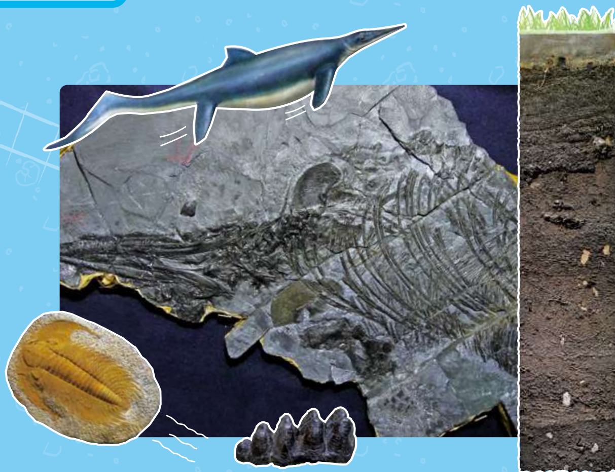
02 青葉山駅 Aobayama Station

The westernmost stop on the Tozai Line, Yagiya Zoological Park is home to about 600 animals (125 species), making it one of the largest in northeastern Japan. Visitors interested in seeing wildlife native to Japan should visit the park's northern corner, which houses such species as the Asian black bear and the wild boar. The zoo also plays a central role in Japan's efforts to conserve the endangered Sumatra Tiger, and a tiger cub named "Ao" was born here in October 2019. Travelers with young children might like to visit the petting zoo, which offers visitors a chance to interact with domestic animals, such as goats, rabbits, and guinea pigs. Before hopping back on the subway, take a moment to check out the beautiful view from Yagiya Zoological Park Station's rooftop terrace.