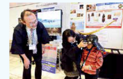
▲Visitors became Sendai warrior Date Masamune by donning a helmet replica at the Sendai City Museum booth.

"Museum Universe" is a major annual event where the SMMA member museums all gather from across Miyagi at sendai mediatheque to deliver talks, workshops, and special exhibits. In line with the significance of the event, parts of it are focused on making museums feel more accessible, with talks by curators describing their work, and by university students doing museum-related volunteer work explaining their activities. The event also offers a chance to casually interact with curators and staff from each museum. The 2014 Museum Universe was a busy two days, with a wide demographic of visitors, as you can see in the following images.