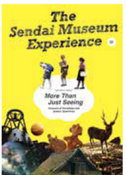
Available at SMMA member museums, as well as other locations in Sendai City, such as community centers and libraries.