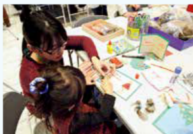
▲Christmas card making, using animal fur and bird feathers at the Sendai Yagiya Zoological Park booth.