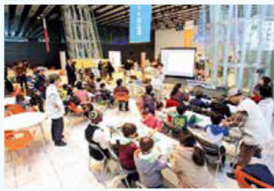
▲Participants at the Sendai City Jomon Site Park talk event made stone accessories using Jomon period techniques.