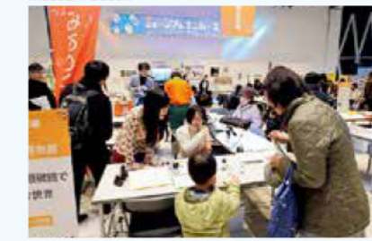
▲A look at tiny organisms using mobile microscopes designed by university teacher and students at the Tohoku University Museum booth.