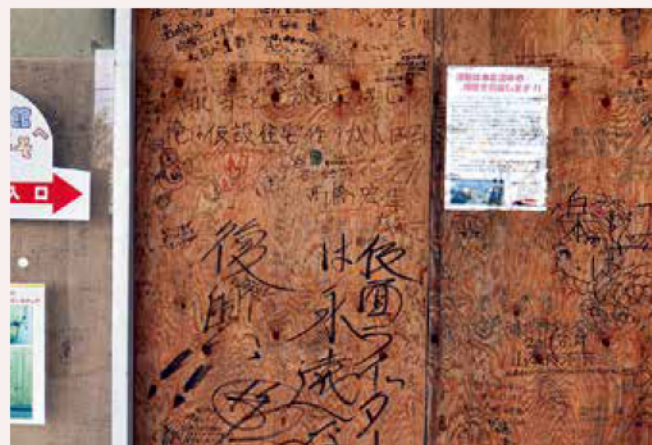
Plywood boarding up the entrance of the disaster-ravaged Ishinomaki Mangattan Museum, covered with messages of encouragement (May 2012)

In 2012, the Sendai Miyagi Museum Alliance (SMMA) conducted an inquiry into reopening procedures following the disaster at museums in disaster-stricken areas. The resulting report can be found on the alliance website ( http://www.smma.jp/survey/english/ ). SMMA also plans to set up a panel exhibition entitled "Museums and the Great East Japan Earthquake" on the second floor of sendai mediatheque for the duration of the UN World Conference on Disaster Risk Reduction this coming March. There is much that should not be forgotten, such as how it was a race against time to protect the animals and cultural assets in museums cut off from crucial infrastructure, how museums deliberated over evacuation procedures in the wake of the possible spread of radioactive contamination, how curators and specialists nationwide gathered to rescue items washed away by the tsunami and investigate the damage on regional cultural assets, and how although many museums have reopened and one-by-one have put on large-scale exhibitions in the name of supporting the restoration, there are also museums that were hardly able to restore